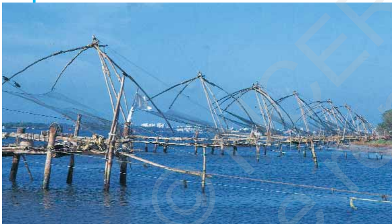
Chinese Fishing Nets

Even the utensil used for frying is called the cheenachatti , and it is believed that the word cheen could have come from China. The fertile land and climate are suited to growing rice and a majority of people here eat rice, fish and vegetables.