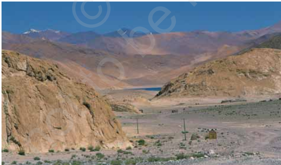
The dry barren landscape of the mountainous desert of Ladakh.

Ladakh is a desert in the mountains in the eastern part of Jammu and Kashmir. Very little agriculture is possible here since this region does not receive any rain and is covered in snow for a large part of the year. There are very few trees that can grow in the region. For drinking water, people depend on the melting snow during the summer months.