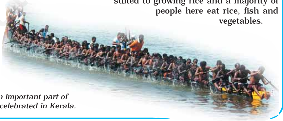
The boat race is an important part of the Onam festival celebrated in Kerala.

an attractive place for traders. Jewish and Arab traders were the first to come here. The Apostle of Christ, St. Thomas is believed to have come here nearly