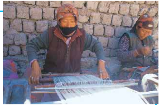
Woman weaving a pashmina shawl

Buddhism reached Tibet via Ladakh. Ladakh is also called Little Tibet. Islam was introduced in this region more than four hundred years ago and there is a significant Muslim population here. Ladakh has a very rich oral tradition of songs and poems. Local versions of the Tibetan national epic the Kesar Saga are performed and sung by both Muslims and Buddhists.