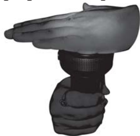
Fig. 4.9 Does torch light pass through your palm?

We can therefore group materials as opaque, transparent and translucent.