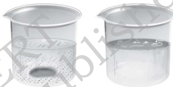
Fig. 4.4 What disappears, what doesn't?

beakers. Fill each one of them about two-thirds with water. Add a small amount (spoonful) of sugar to the first glass, salt to the second and similarly, add small amounts of the other substances into the other glasses. Stir the contents of each of them with a spoon. Wait for a few minutes. Observe what happens to the substances added to water (Fig. 4.4). Note your observations as shown in Table 4.3.