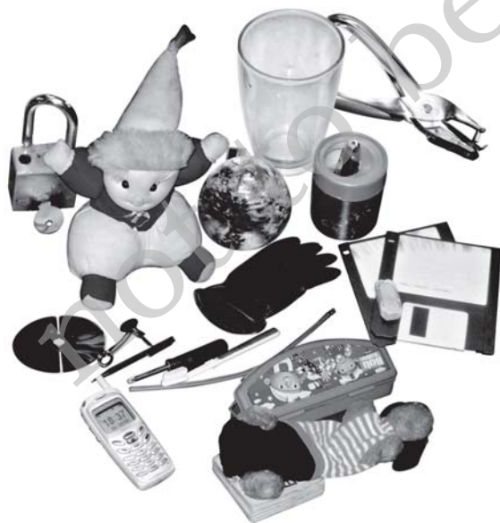
Fig. 4.1 Objects around us

Let us collect as many objects as possible, from around us. Each of us could get some everyday objects from home and we could also collect some objects from the classroom or from outside the school. What will we have in our collection? Chalk, pencil, notebook, rubber, duster, a hammer, nail, soap, spoke of a wheel, bat,