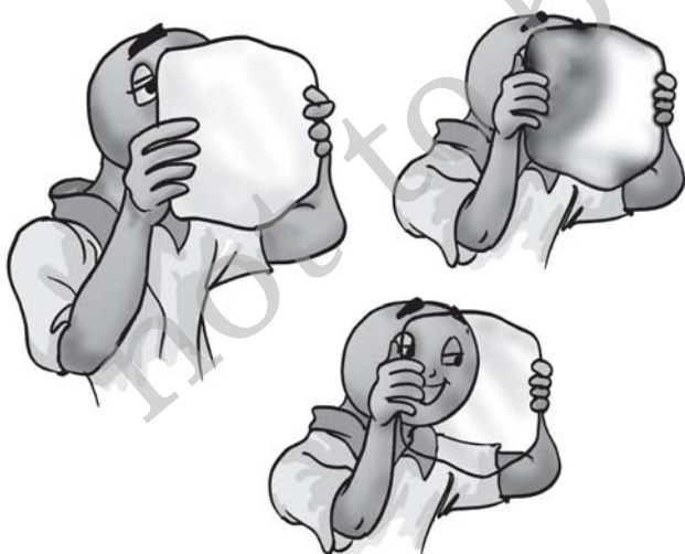
Fig. 4.7 Looking through opaque, transparent or translucent material

You might have played the game of hide and seek. Think of some places where you would like to hide so that you are not seen by others. Why did you choose those places? Would you have tried to