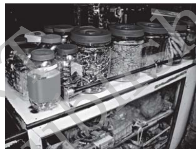
Fig. 4.8 Transparent bottles in a shop

hide behind a glass window? Obviously not, as your friends can see through that and spot you. Can you see through all the materials? Those substances or materials, through which things can be seen, are called transparent (Fig. 4.7). Glass, water, air and some plastics are examples of transparent materials. Shopkeepers usually prefer to keep biscuits, sweets and other eatables in transparent containers of glass or