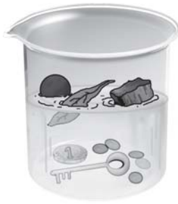
Figure 4.6 Some objects float in water while others sink in it

drops of honey that you let fall into a glass of water. What happens to all of these?