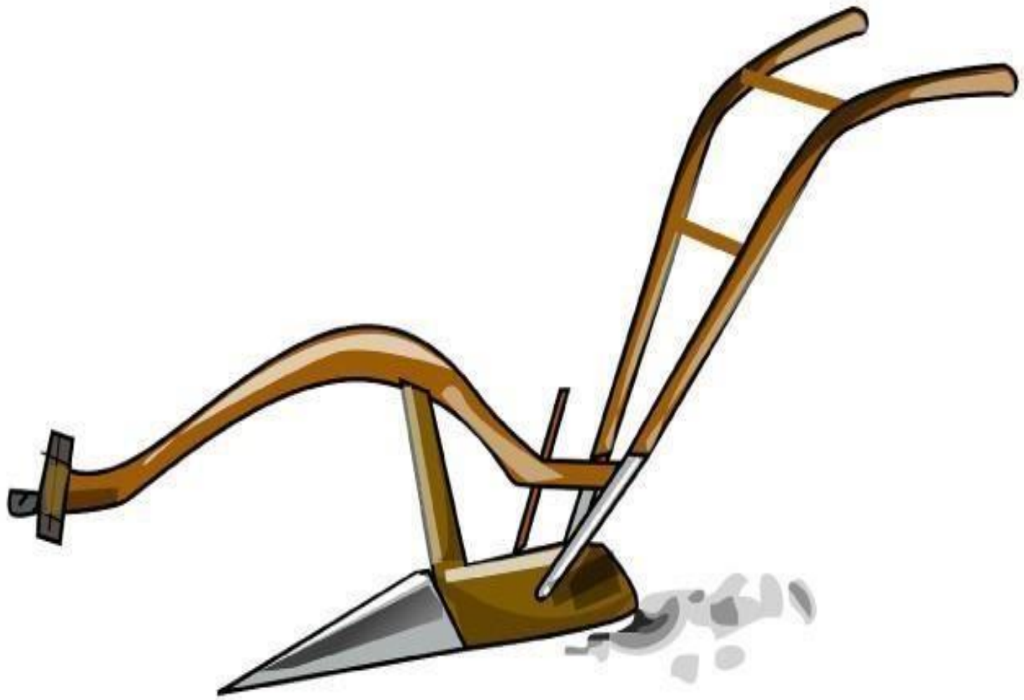
A traditional wooden plough