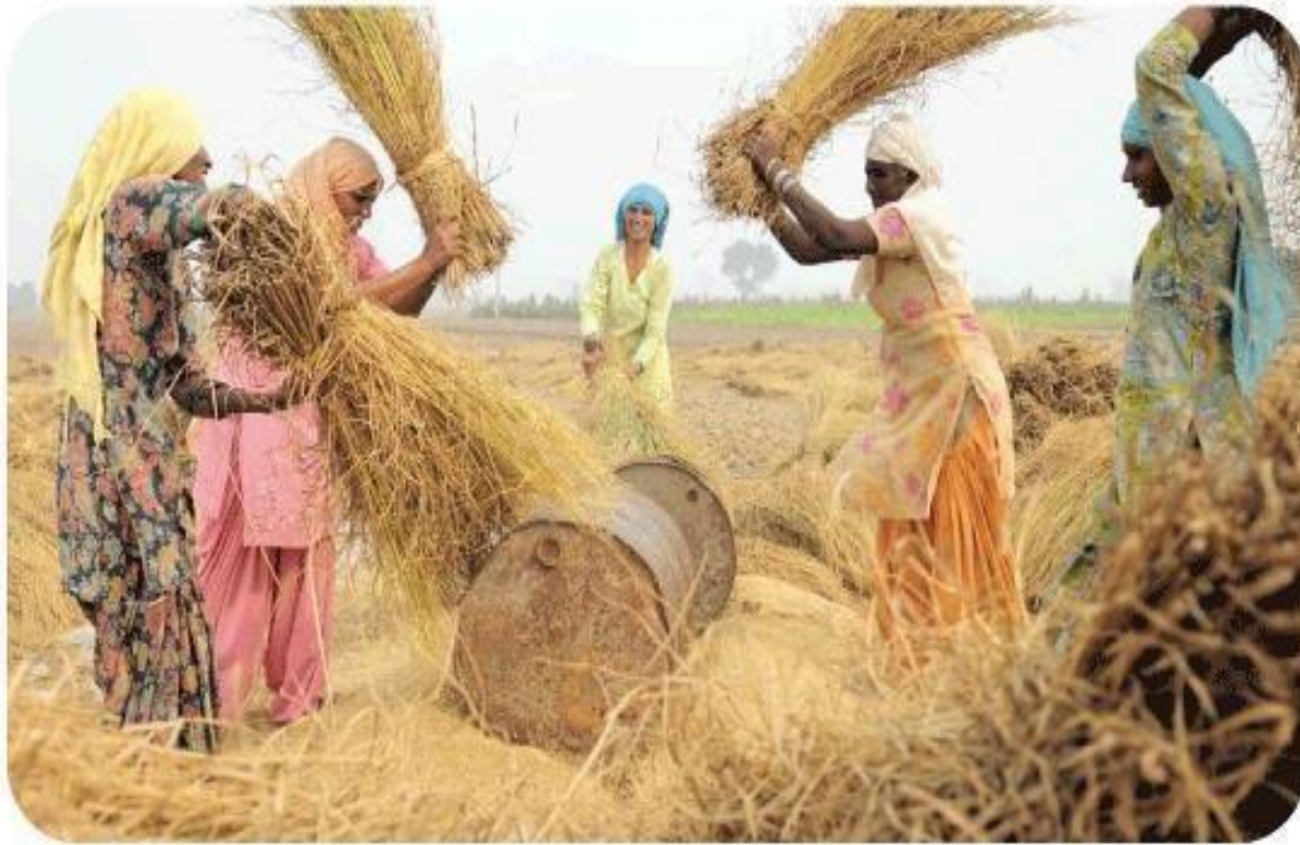
Manual Threshing of Crops