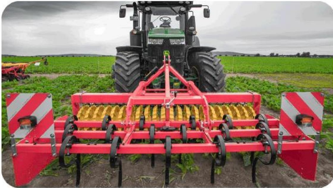
A modern-day cultivator