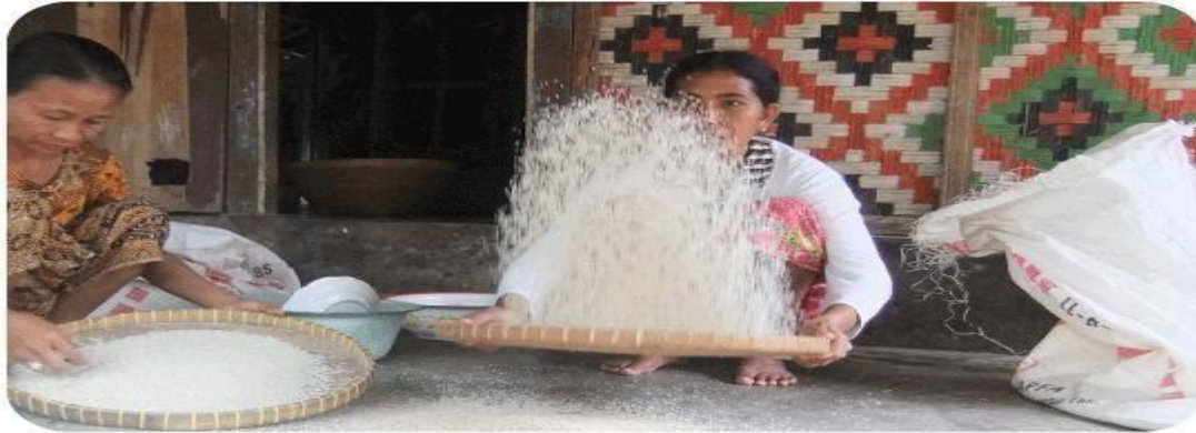
Winnowing of Rice