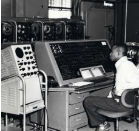
A UNIVAC computer at the Census Bureau.